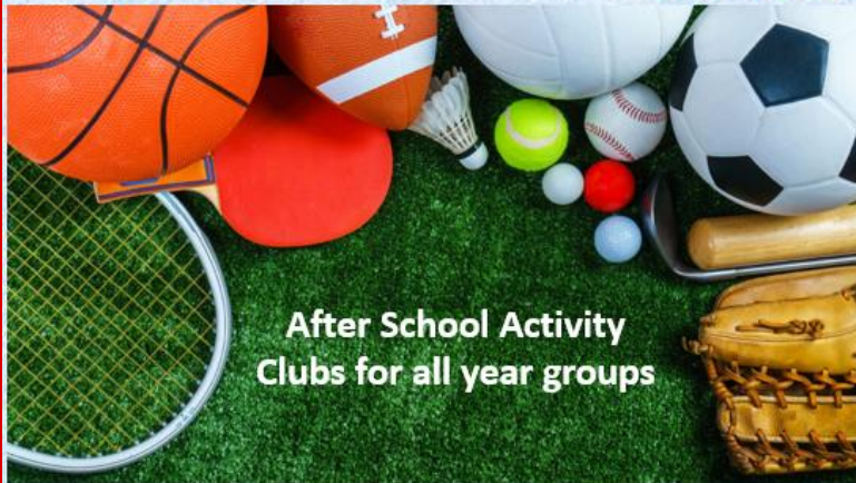
After School Activity Clubs for all year groups

Enrichment workshop for every year group. This year's Year R are having a fun Zoo visiting them at school!